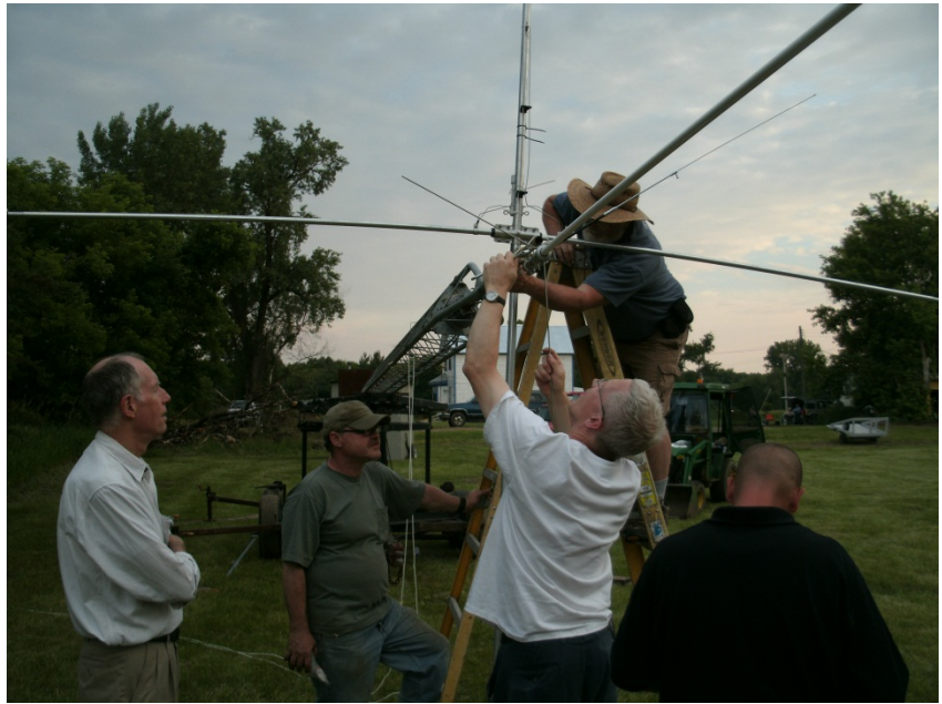
Field Day 2011 volunteers assemble an antenna in preparation for the field day event.

One last team needs to sweep the Field Day Site to make sure it is clean and all our stuff has been removed.